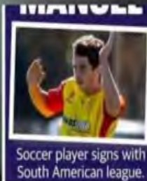
Soccer player signs with South American league.