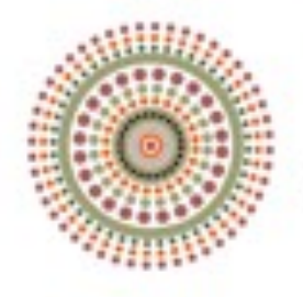
Monday 26 June NAIDOC Prayer Assembly 8:45am in the Hall